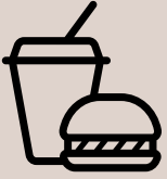
Food & Beverages

Halal Trade, Logistics and Manufacturing Expo will further strengthen Africa's position as a global halal hub and put forward the economic values of Halal for the world.